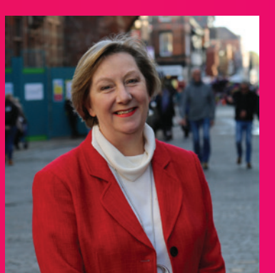
A MESSAGE FROM SAMANTHA DIXON MP